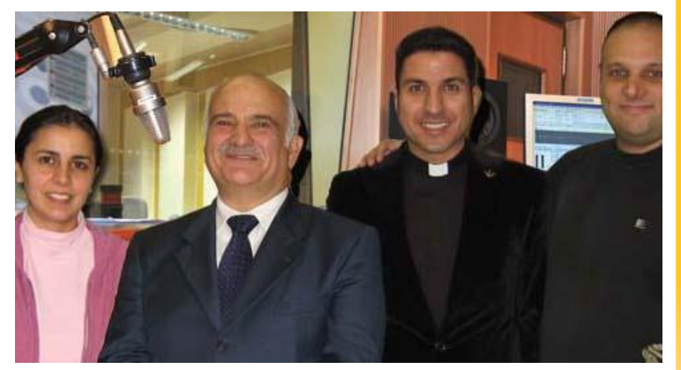
HRH prince El Hassan with Vatican Radio Arabic Desk staff

The debate examines all the realities of life of the Christian communities of the countries involved, in its relation to other faiths and the civilian society.